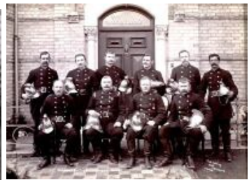
Family, Life and Work Experience 1